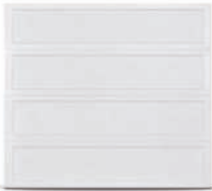
Flush Panel: 2294 Flush