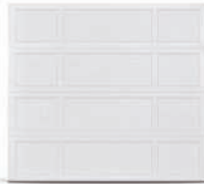
Combo Panel: 2296