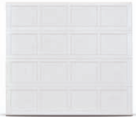
Short Panel: 2298